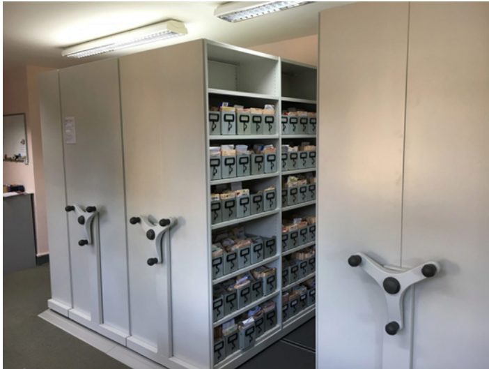
Example of a storage system